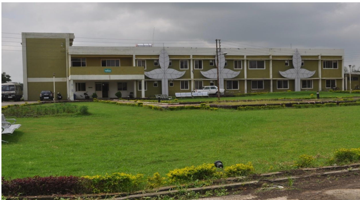
Hostel – Narmada