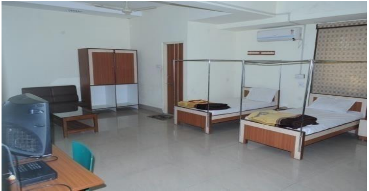
Bed room in Hostel