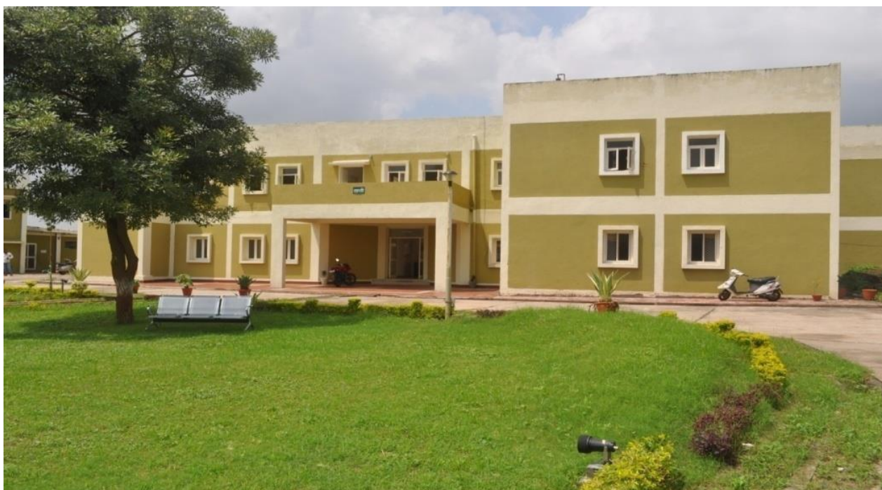
Hostel – Tapti